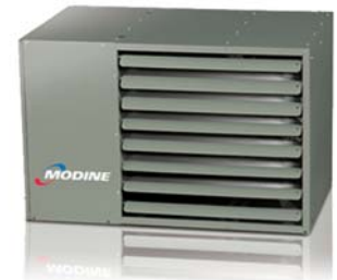
SEPARATED COMBUSTION HDS, HDC, PTS, BTS