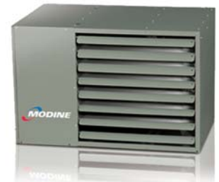
POWER VENTED HD, HDB, PDP, BDP, PTP