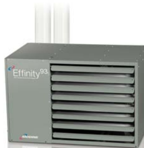
HIGH-EFFICIENCY SEPARATED COMBUSTION PTC, BTC