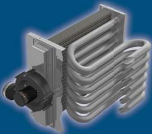
MODINE CONSERVICORE® HEAT EXCHANGER

At 93% thermal efficiency for all model sizes, Modine's Effinity 93 condensing unit heater features the highest efficiency available in North America for commercial and industrial, as well as residentially certified (sizes 110 and smaller) gas-fired unit heaters. This industry leading efficiency is a result of the coupling of our Conservicore ® secondary heat exchanger technology with our robust tubular primary heat exchanger design. The Conservicore ® technology features a secondary recuperative heat exchanger fabricated from AL29-4C ® stainless steel. This material is superior to other lower grades of stainless steel and aluminum, resulting in outstanding ability to withstand the corrosive environment of condensing gas fired equipment.